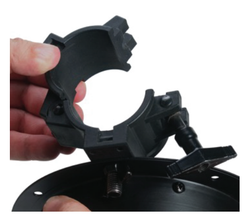
Attach the clamps securely to the mounting holes on the motor. Make sure the clamps are firmly attached to the motor before mounting to the truss.