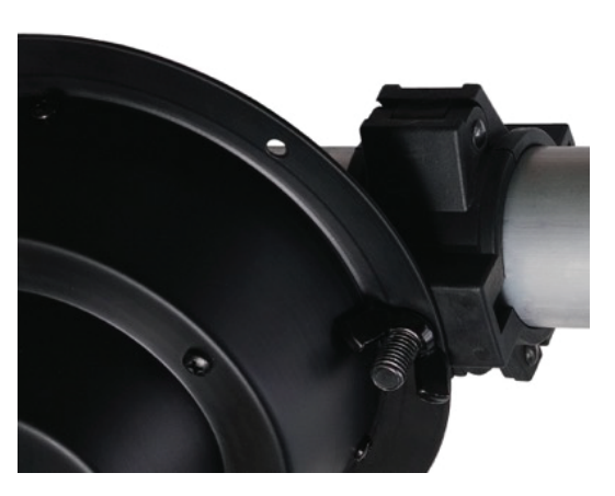
Attach to motor to the truss with both clamps. Always verify that the motor is fully and securely attached.